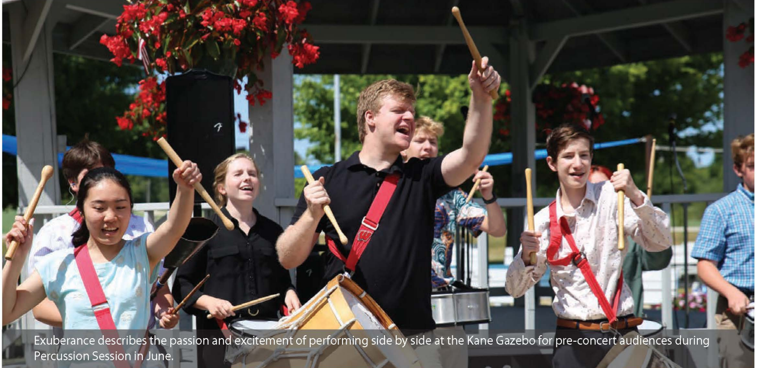
Exuberance describes the passion and excitement of performing side by side at the Kane Gazebo for pre-concert audiences during Percussion Session in June.

Birch Creek Music Performance Center | Egg Harbor | Door County | Wisconsin