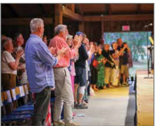
We celebrate YOU with our Opening Night concert on June 22, where we thank you for the joy you bring to Dutton Concert Barn.

Our educational model is performance-based. It is critical for students to perform for enthusiastic audiences in order for their musical skills to improve. Within days of arrival, students are performing on stage under the tutelage of our expert, world class faculty. This model for learning provides incentives to learn at a remarkable rate and perform live music for you, the Birch Creek concertgoer. Birch Creek's mission — the reason for our being — was accomplished with incredible fervor this season.